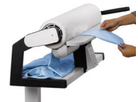
WIDE ITEM PRESSING