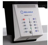
FULL STEAM CONTROL